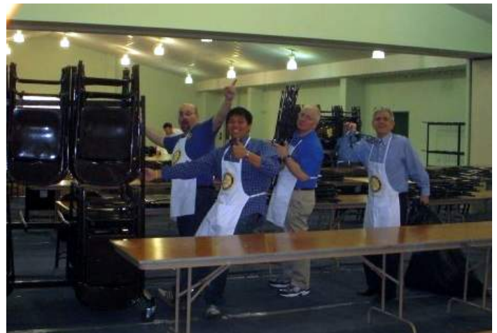
Clean up Crew dancing?