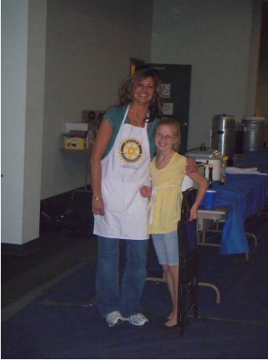
Grill Crew taking a break